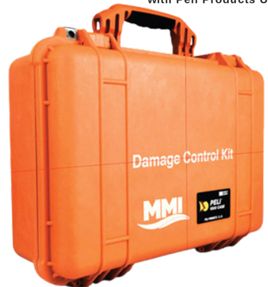
Housed in a genuine Peli™ 1500 Protector Case (Peli Products UK) • High-visibility orange for rapid identification